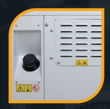
40 It fuel tank