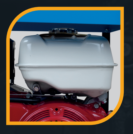
5,3 It Fuel Tank