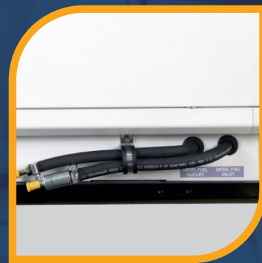
Input/Output fuel pipe

We offer now what others will do tomorrow.