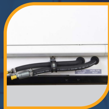
Input/Output fuel pipe

We offer now what others will do tomorrow.