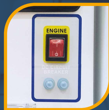
Emergency stop switch

We offer now what others will do tomorrow.